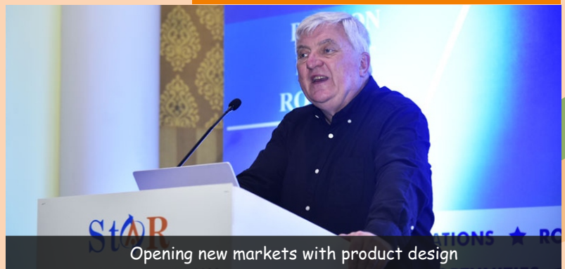
Opening new markets with product design