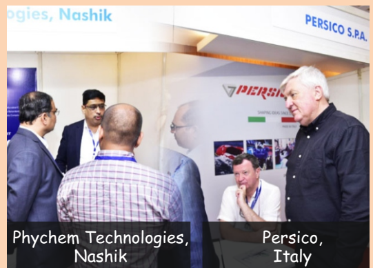
Phychem Technologies, Nashik

The Roto show in well laid out octanorm booths showcased latest developments of the supplier exhibitors and remained a busy