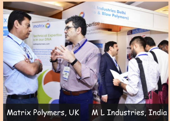
Matrix Polymers, UK