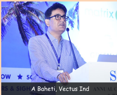
A Baheti, Vectus Ind