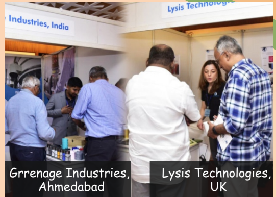
Grrenage Industries, Ahmedabad

hub right through the conference. Five domestic and three international exhibitors exhibitors were: