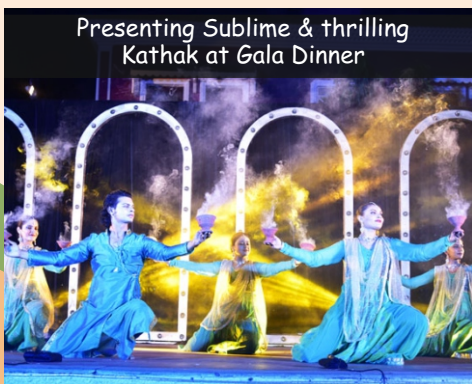
Presenting Sublime & thrilling Kathak at Gala Dinner

The Gala dinner evening brought out the best of the exotic orient – Classical Kathak extravaganza by Anart dance group of Ahmedabad in a surreal setting. The beautifully lit up and artistic décor was perfect stage for scintillating dances & intricate moves. Cocktails & buffet dinner kept spirits high for a very enjoyable evening.