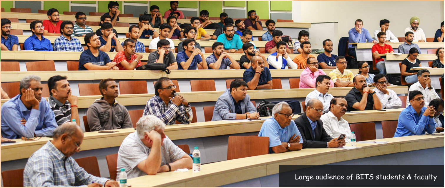
Large audience of BITS students & faculty