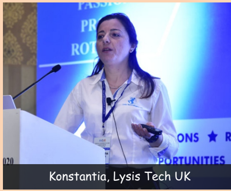
Konstantia, Lysis Tech UK

hub right through the conference. Five domestic and three international exhibitors exhibitors were: