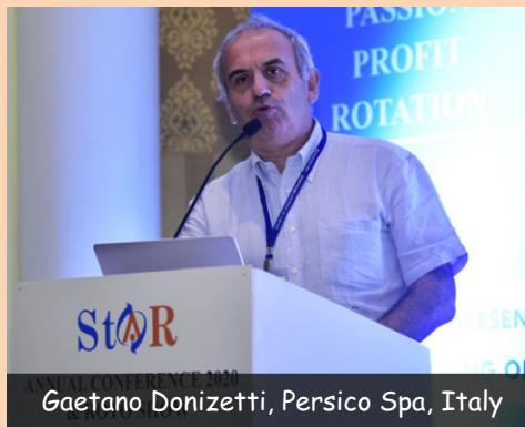
Gaetano Donizetti, Persico Spa, Italy