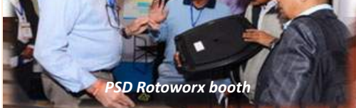
PSD Rotoworx booth