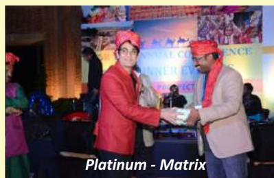
Platinum - Matrix