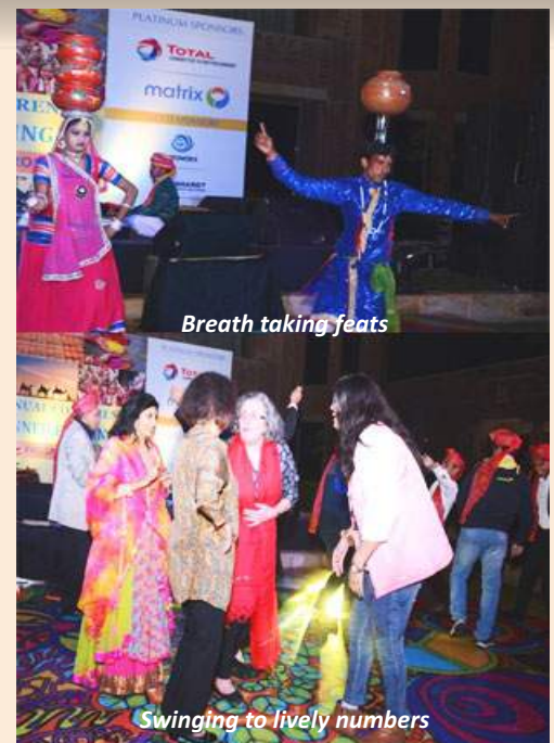
Breath taking feats