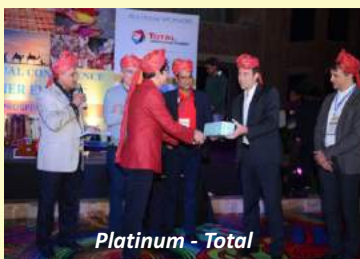
Platinum - Total