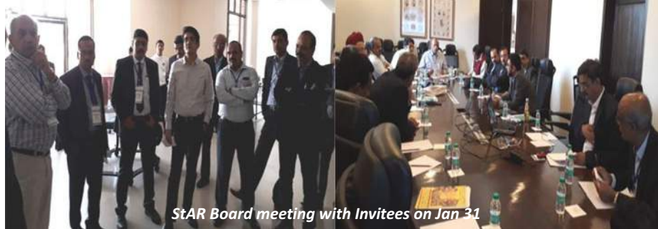
StAR Board meeting with Invitees on Jan 31