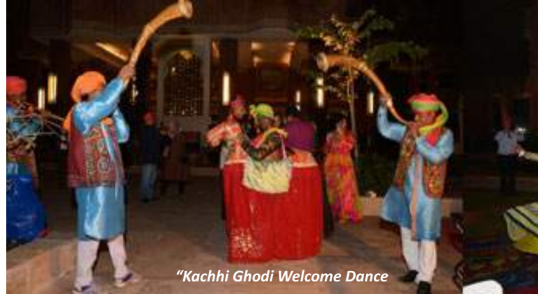
"Kachhi Ghodi Welcome Dance"