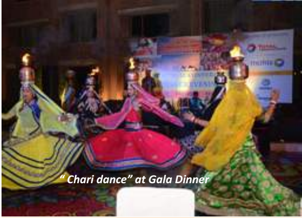
"Chari dance" at Gala Dinner