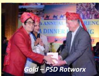
Gold – PSD Rotworx