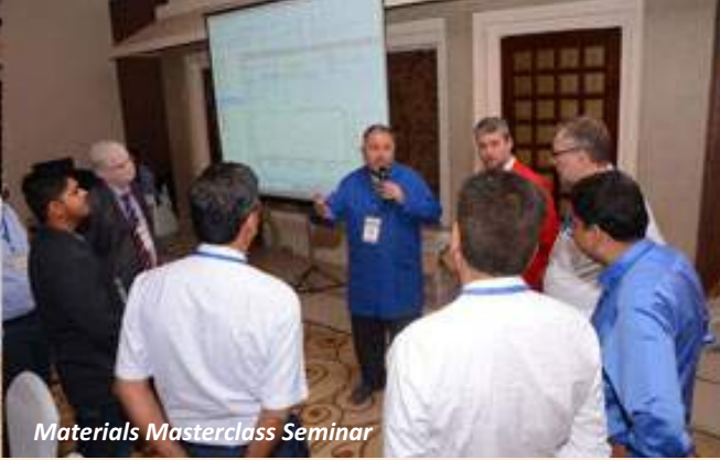
Materials Masterclass Seminar