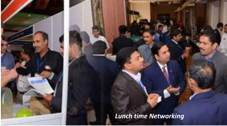
Lunch time Networking