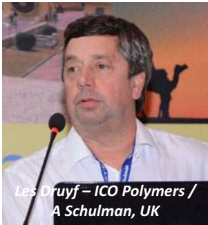
Les Druyf – ICO Polymers / A Schulman, UK

OEE - Overall Equipment Efficiency by Blaise looked at efficiency differently and is a part of the concept of Total Productivity Maintenance (TPM). Usually efficiency is defined as output/input. Under OEE, one looks at the components of efficiency