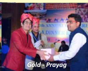
Gold - Prayag